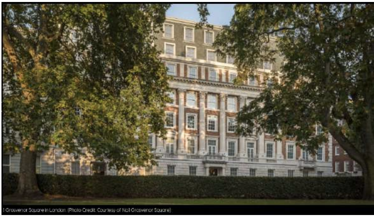
Grosvenor Square in London